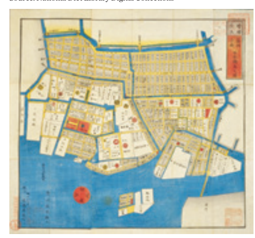
A map from the Edo period of the Nihonbashi Kabutocho area of Tokyo.