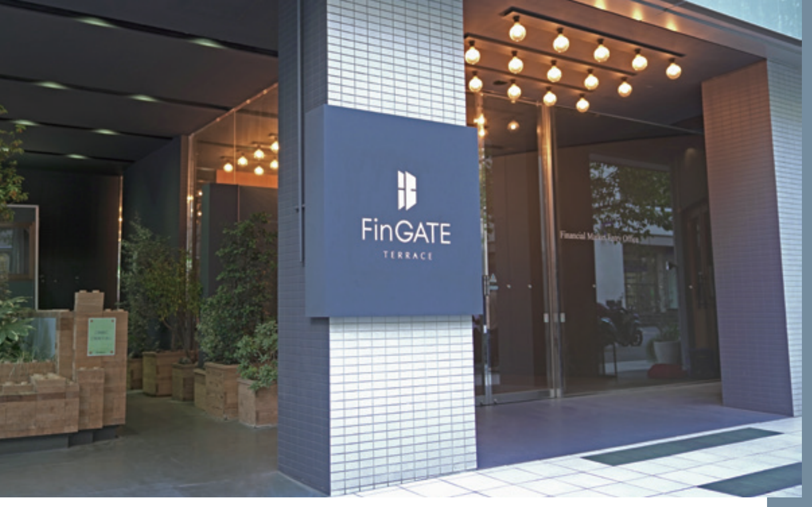
The entrance to one of Heiwa Real Estate's FinGATE buildings, also housing the Financial Market Entry Office