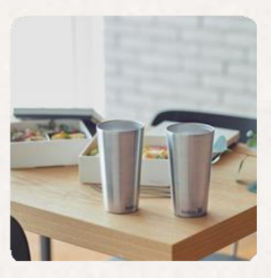
Functional containers with simple design

You can return the cup at any nearby shop.