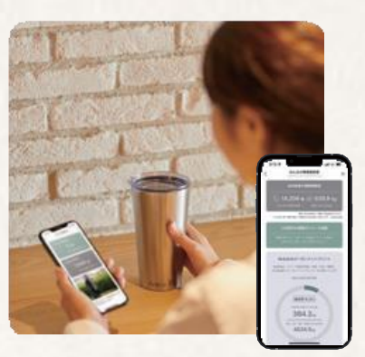
Open to the public how much it contributes to environmental protection.

Washed in a facility that meets Re&Go hygiene standards