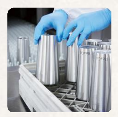
Hygiene-controlled, clean containers

Heat/cold-insulating, functionality different from single-use containers